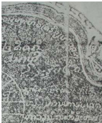
Plate 5: Tha Khek, 15 th C.