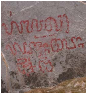
Plate 3: Tham Nang An, 14 th C?