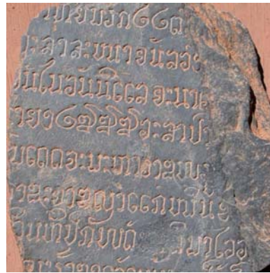
Plate 4: Muang Sing, 15 th -16 th C.